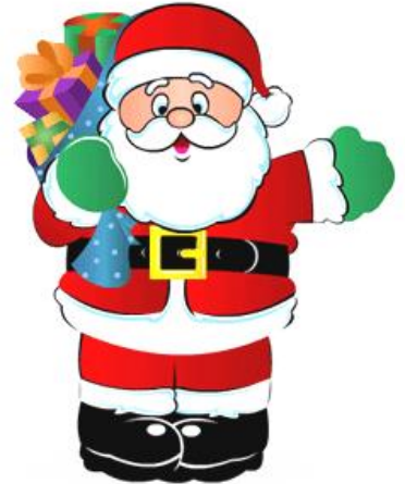
Illustration by Nikita Hol

All donations of prizes and good condition teddies will be very gratefully received.